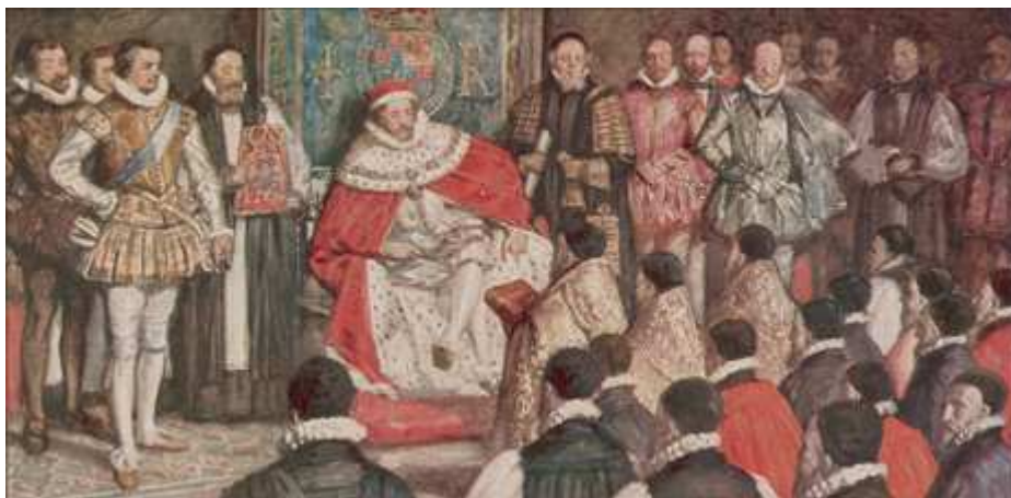
King, Bishops and Puritans at Hampton Court, January 1604 8